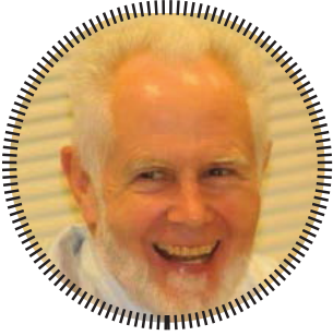
Paul T. Murray Civic Engagement Award