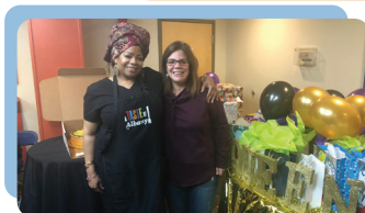
Interfaith Partnership for the Homeless